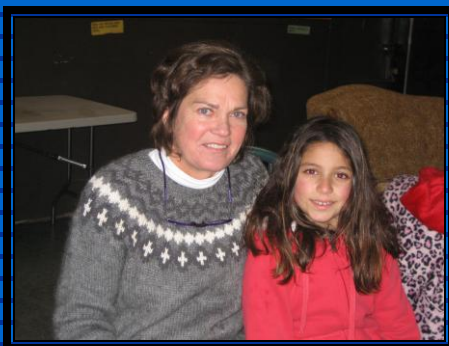
Special Times for Bigs & Littles