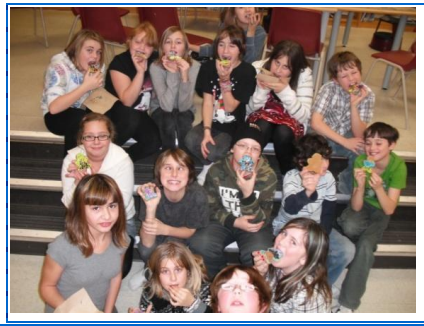
180 Group Kids at Byng - Dec. 2010