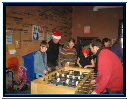
Enjoying a game of foosball!