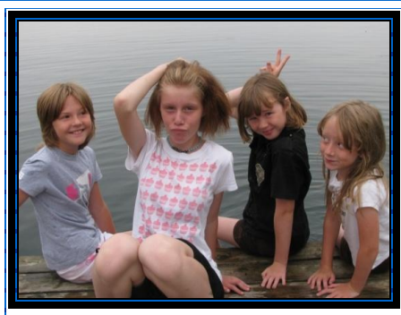
Having fun by the water!